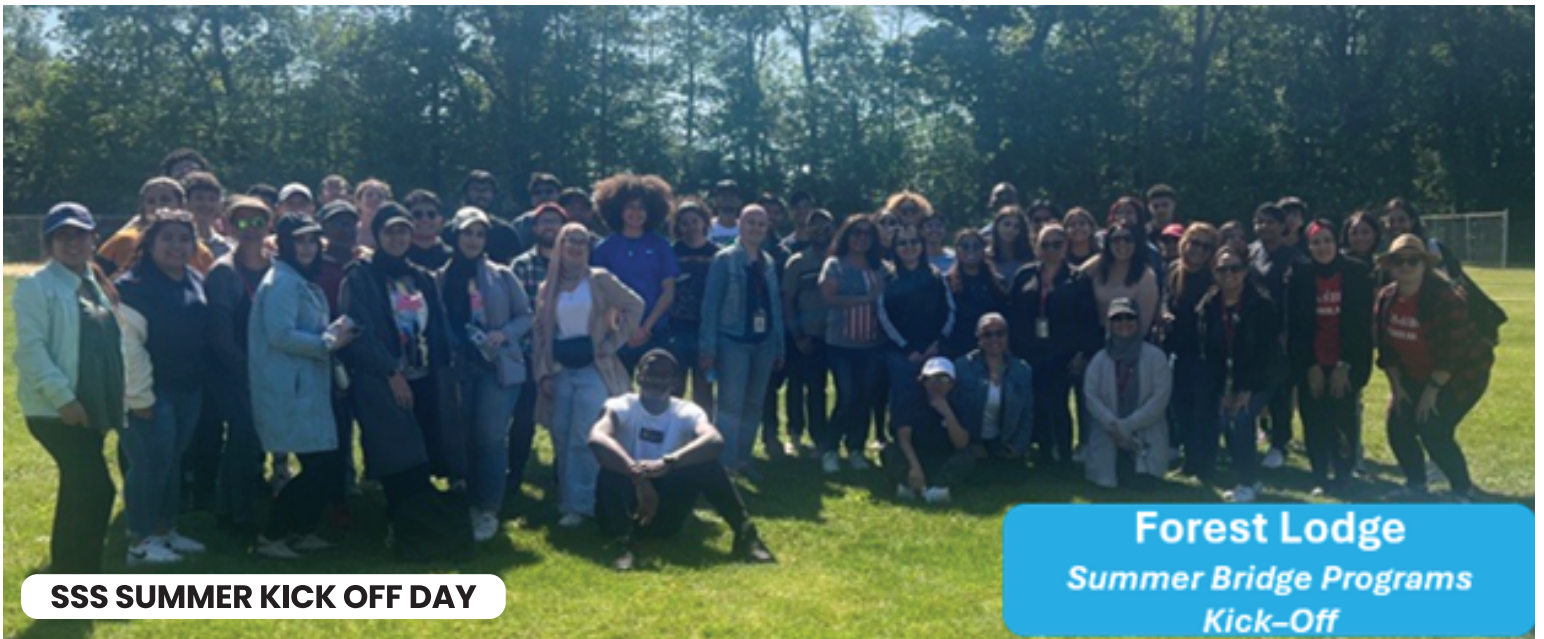
SSS SUMMER KICK OFF DAY

Forest Lodge Summer Bridge Programs Kick-Off