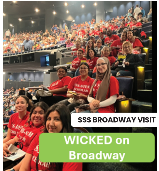
SSS BROADWAY VISIT

In 2024, PCCC is poised to expand the number of students involved in summer programs. In particular, PCCC has recently launched two new initiatives, PCCC Reconnect, which is focused on serving stop-out students, as well as a newly funded Pathways to College Completion grant intended to improve onboarding processes for incoming PCCC students and students involved in Early College programs.